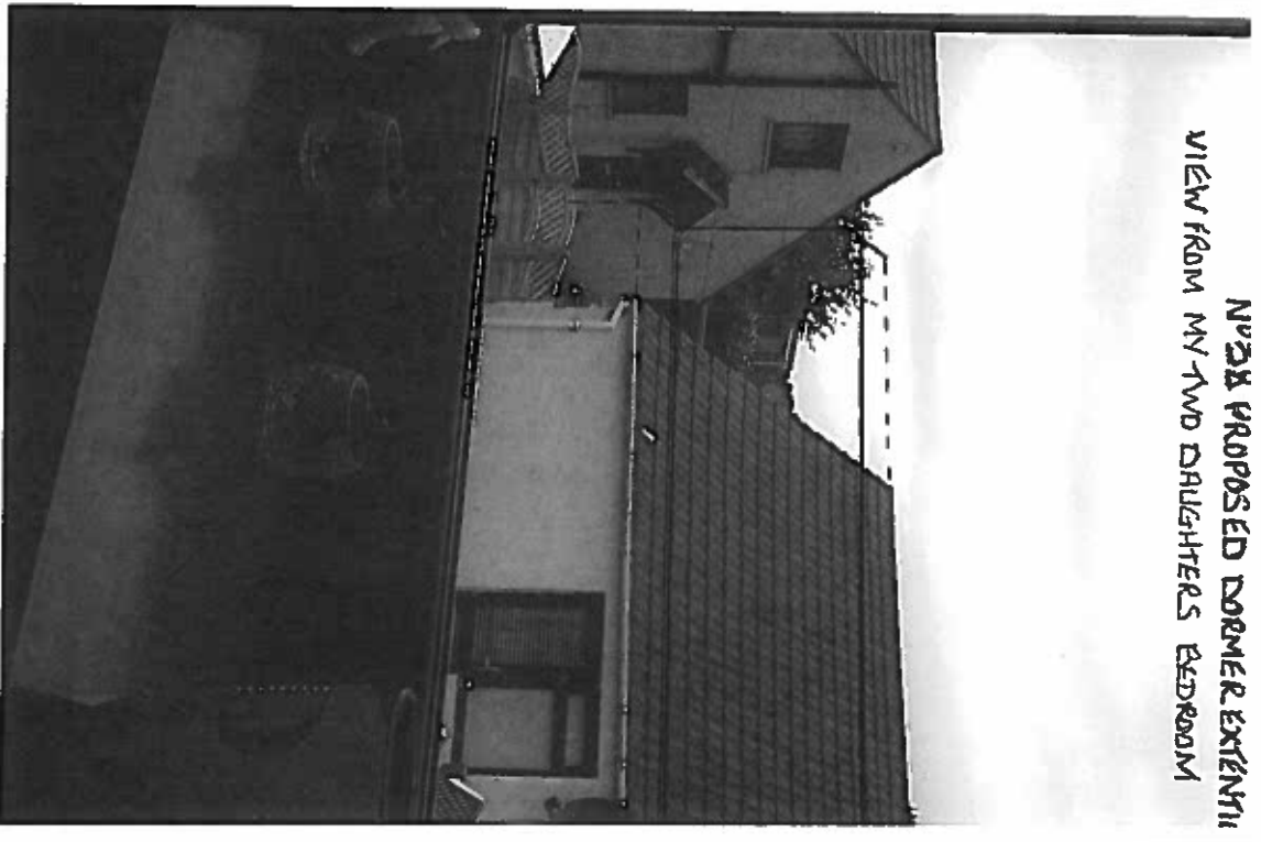
No 38 PROPOSED DORMER EXTENSION VIEW FROM MY TWO DRAUGHTERS BEDROOM